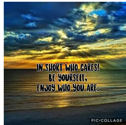
By Jade Berry